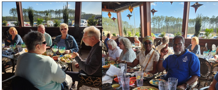
A group of off-duty Berkeley Hospital volunteers gathered to socialize at Agave restaurant for laughter, food and camaraderie.